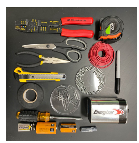
Figure 4: Supplies