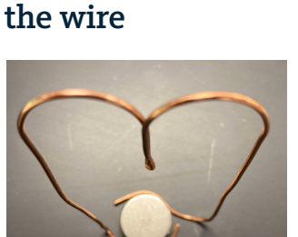
Figure 2: Bending