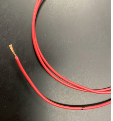
Figure 5: Mark and strip the wires on each end