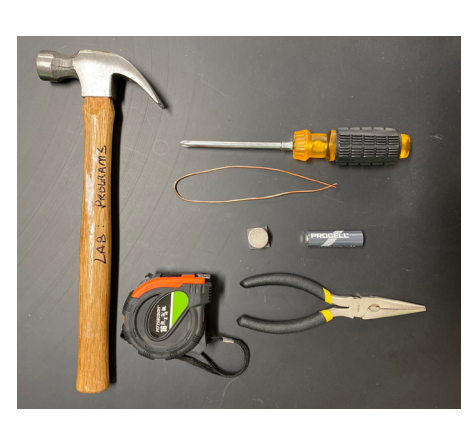
Figure 1: Supplies