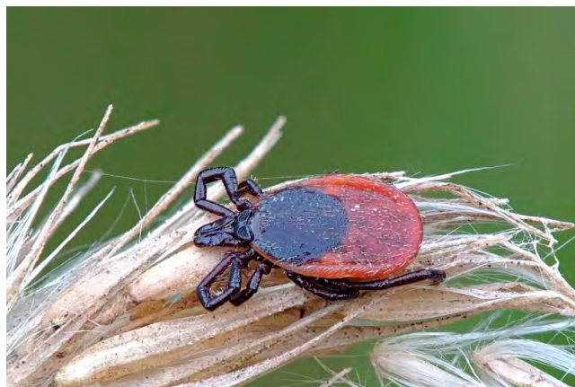
Fig. 1. Photograph of an Ixodes tick perched on dry grass. Species of these ticks are responsible for the transmission of Lyme disease. They may be characterized by their partial, ornate, oval-shaped dorsal shield. In their larval state, these ticks will tend to feed on smaller rodents, such as mice, but as the tick matures, it will begin to feed on much larger mammals, namely white-tailed deer.

Mites are tiny eight-legged animals that share common anatomy with ticks. We believe they give clues to pre-fall functions and purposes for ticks on earth as decomposers. Although mites and ticks may be in different baramins, their functions in the ecosystem may parallel one another and might provide clues to their original very good purpose. More research on this topic is needed. Even though they are quite small, mites are important to humans and other animals. Most species are beneficial decomposers, breaking down organic matter and allowing nutrients to be used by plants again. Ticks are ectoparasites, feeding on the blood of mammals, birds, and sometimes reptiles and amphibians. The timing of the parasitic origin of ticks is uncertain. Most likely they were decomposers living off dead plant and organic matter, recycling the elements in nature. At some time after Adam's sin and the curse, they lost their ability to extract necessary materials from plant hemoglobin and started depending upon animal blood. All female ticks need animal blood to make eggs. Many male ticks exist merely to mate and do not necessarily feed on animals. 1