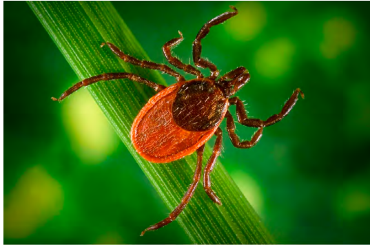
Fig. 3. The blacklegged tick, I. pacificus , is a vector for B. burgdorferi , which causes Lyme disease. Author: James Gathany. CDC. https://phil.cdc.gov/Details.aspx?pid=7663 . Public Domain.