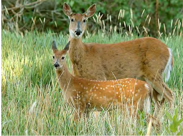
Fig. 6. Image depicting white-tailed deer in the wilderness. These animals directly function as the definitive hosts for Ixodes scapularis. White-tailed deer exhibit virtually no symptoms of Lyme disease infection. White-tailed deer that mainly reside in taller grass environments are more prone to harbor an increasing presence of black legged ticks known for transmitting Lyme disease. “Both white-tailed deer and mule deer are found on Rocky Mountain Arsenal National Wildlife Refuge. White-tailed deer can be distinguished by the large white patch underneath their tails.”

are the typical reservoir hosts and serve as a source of infection for humans or another species. Small mice and chipmunks are the primary hosts that keep the Borrelia bacteria going in the woods and the edge habitat (high grass) across the U.S. and world. The small mammals are the reservoir host for the ticks. But the high numbers of ticks with their bacteria in rodents rarely, if ever, cause disease in these small mammals.