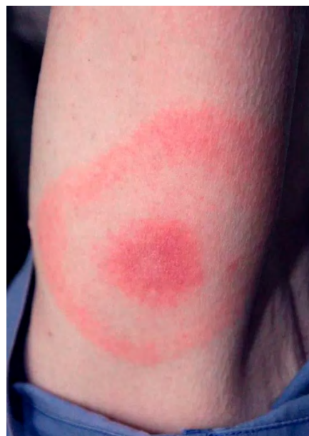
Fig. 2. Photograph of erythema migrans on the epidermis, also known as bull's eye rash. This may be characterized as an expansive skin rash that is indicative of the early signs of Lyme disease. The rash can spread up to 12 inches in diameter and is caused by the gradual radial movement of Borrelia burgdorferi , as the bacteria move outwardly from the site of the tick bite.

There are approximately 476,000 people diagnosed and treated with Lyme Disease each year.