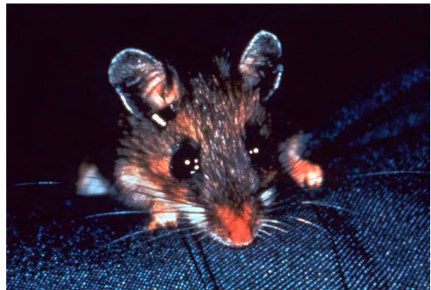
Fig. 7. Close-up image of Peromyscus leucopus , commonly referred to as the White-footed mouse. These species of mice, among other smaller rodents, function as primary reservoir hosts for Borrelia Burgdorferi to amplify to increased numbers. These mice do not typically manifest any signs or symptoms related to Lyme disease, regardless of bacterial prevalence in the host itself. Likewise with white-tailed deer, these creatures will express higher levels of Borrelia in high grasslands surrounding the east coast. “This photograph depicts a white-footed mouse, Peromyscus leucopus , which is a wild rodent reservoir host of ticks, which are known to carry the bacteria, Borrelia burgdorferi , responsible for Lyme disease. During their larval stage, Ixodidae, or “hard ticks” feed on small mammals, particularly the white-footed mouse, which serves as the primary reservoir for B. burgdorferi . “(File: Peromyscus leucopus .JPG. (2021, May 21). https://commons.wikimedia.org/w/index.php?title=File:Peromyscus_leucopus.JPG .

In Lyme Disease, white-tailed deer (fig. 6) are the “normal” definitive host (final host), as they are a host for the tick host (hence the commonly used name “deer” tick). This is where the parasite attains sexual maturity and Ixodes ticks mate. After mating, the female tick (fig. 3) produces eggs, and the cycle of larva, nymph, and adult continue. Deer rarely experience symptoms of Lyme disease like humans. White-footed mice (fig. 7)