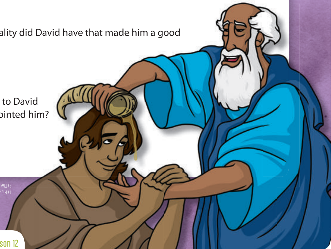
1) His appearance. 2) He had a heart for God. 3) The Spirit of the Lord came upon him.