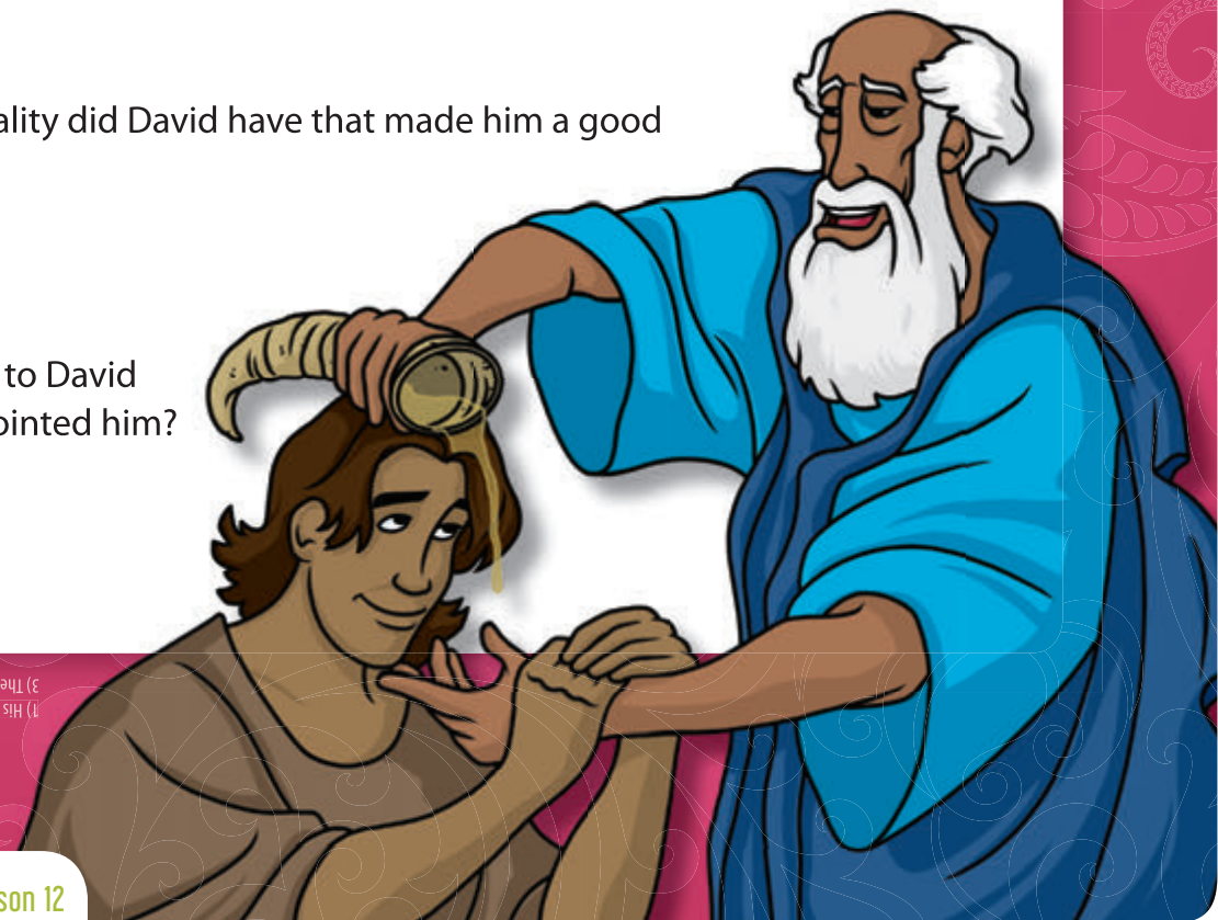
1) His appearance. 2) He had a heart for God. 3) The Spirit of the Lord came upon him.