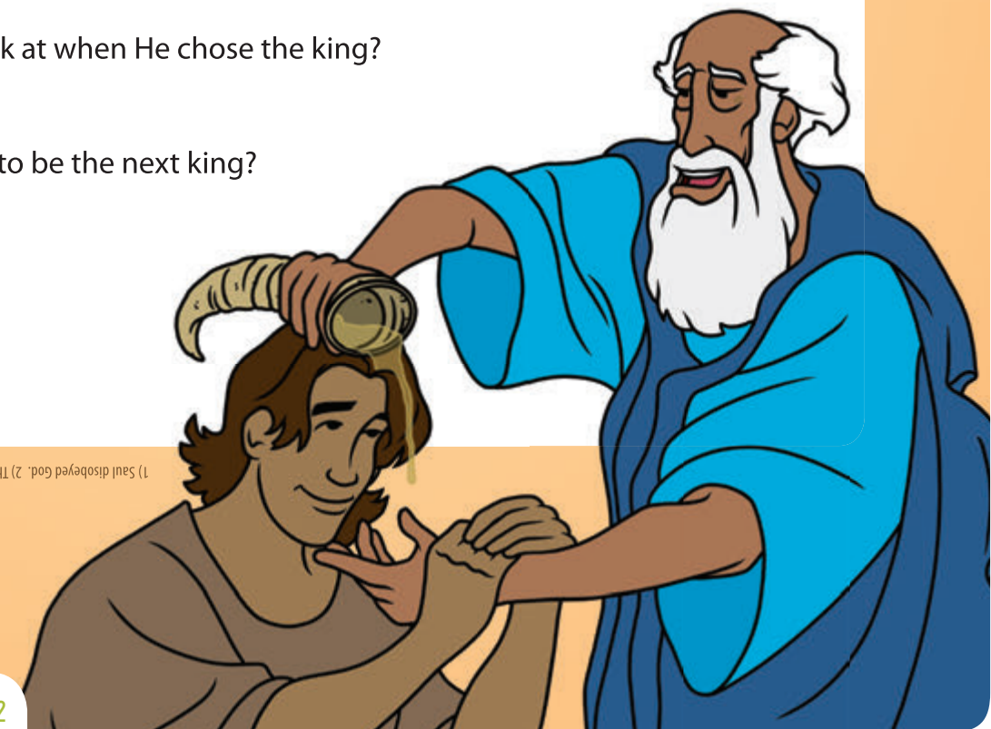
1) Saul disobeyed God. 2) The heart. 3) David.