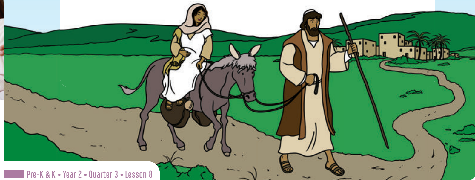
1) Through the prophets. 2) Bethlehem. 3) Jesus.