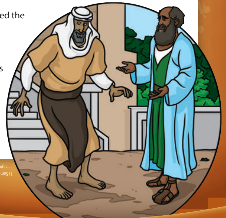
1) Some people believed. Some did not. 2) Miracles—signs and wonders such as healing. 3) They wanted to stone him.