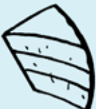
slice of cake