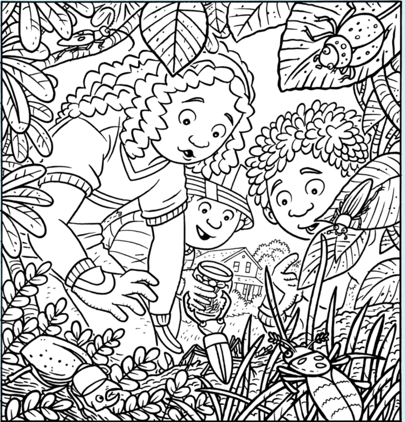
illustration by Chuck Dillon