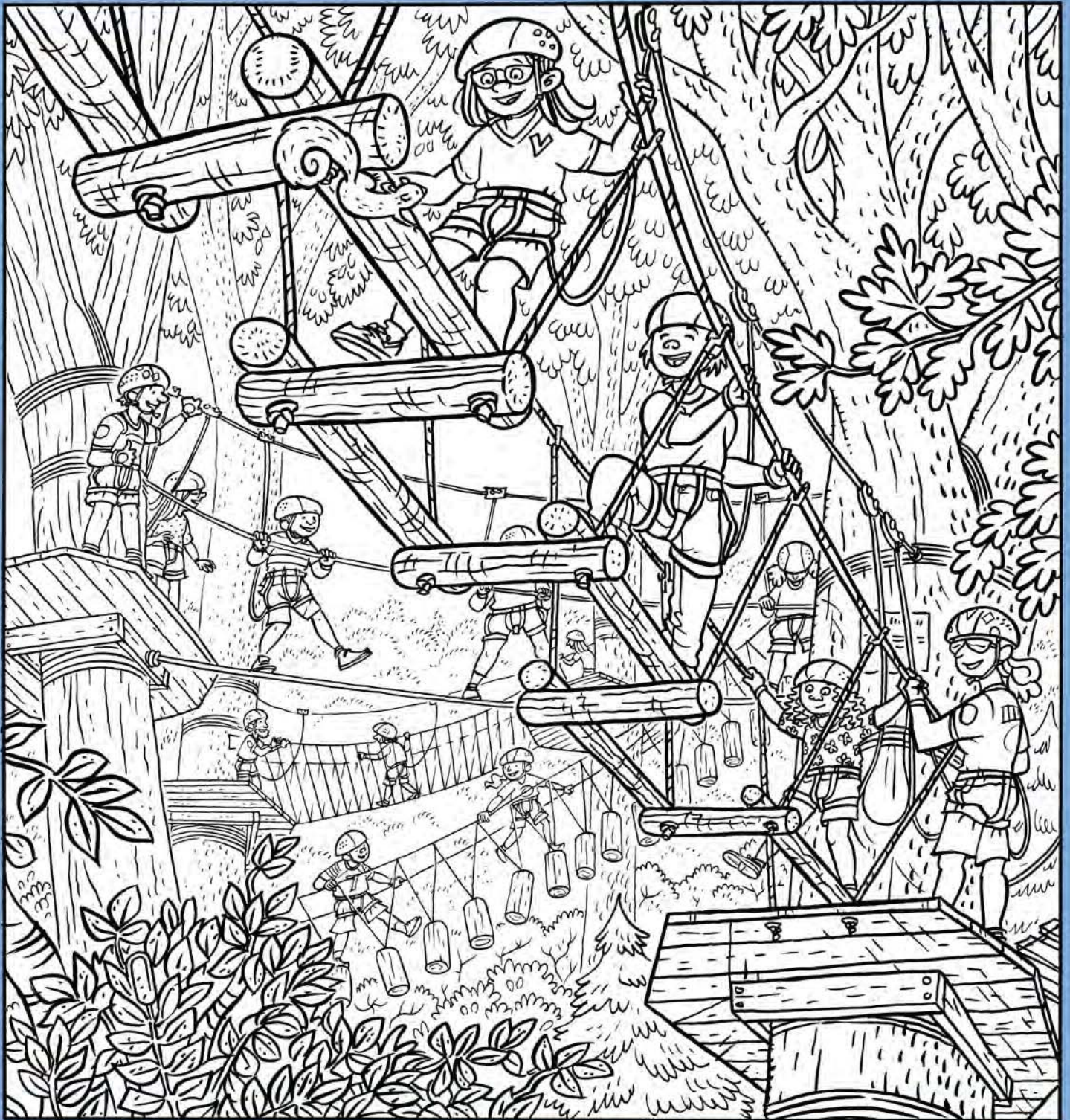
art by Chuck Dillon