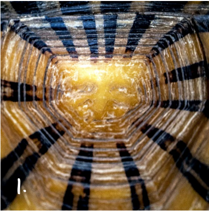
1. ETTURL _____