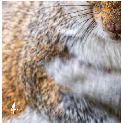
4. QUSRLIRE _____

Take a look at these close-up images of things you might see or take with you on a hike. Can you guess what they are and unscramble their names?