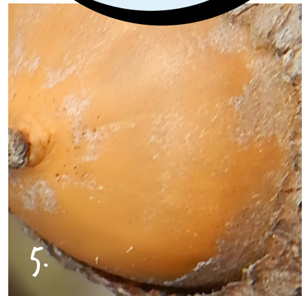
5. CNORA _____

Take a look at these close-up images of things you might see or take with you on a hike. Can you guess what they are and unscramble their names?