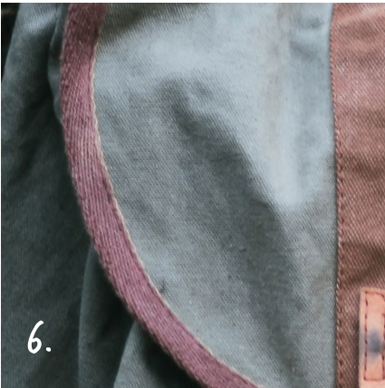
6. ACBKPCAK _____