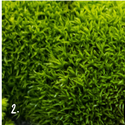
2. SOMS _____