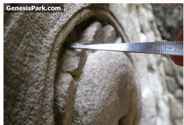
Fig. 13. Measuring stegosaur plate relief.

If the artist was able to model the plated body of a stegosaur so effectively, what about the oversized, blunt head and missing tail spikes? I think a clue to answering that question is the odd triangular shape coming up the side of the animal's head with a bump or ring at the base of it. Is this merely a poor attempt to portray an ear? Probably not. It follows the jawline and is unlike the ear of an elephant, hippo, boar, or rhino (all creatures that skeptics have presented as alternative identifications). Moreover, many upright mammalian ears are typically composed of sturdy cartilage that would stand up straight and not curve in, hanging against the upper body. Postulating that these are horns is even more problematic since they