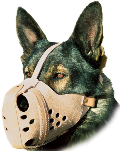
Fig. 14. Muzzled canine.

would be nearly useless on the sides of the head and curved tight to the body. I postulate that this engraving is a depiction of a captive stegosaur that has been muzzled, much as we would muzzle a dog today (Fig. 14). Fitting such a muzzle over a plated stegosaur head and attaching it firmly to the back of the neck would require a large design. This explains both the oversized head and that odd device coming up the side. The large muzzle could double as a kind of bridle, an attachment place for reins. Other engraving at Ta Prohm shows bridled horses and riders.