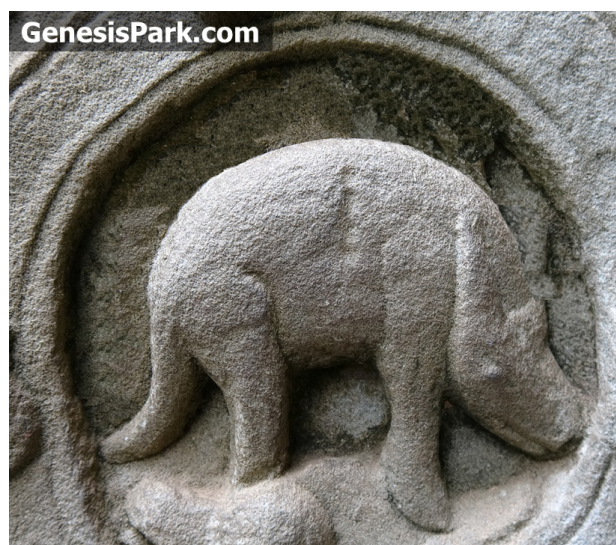
Fig. 8. Engraving without plates.