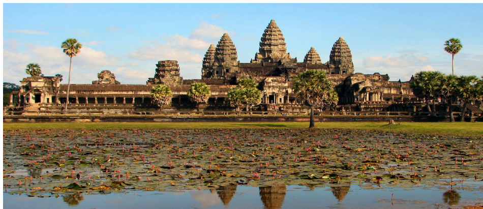
Fig. 2. Angkor Main Temple.

The Ta Prohm temple was constructed around AD 1200 to be a Buddhist monastery and university and it is large enough for thousands of people to have actively worked there. Ta Prohm's traditional Khmer construction is made up of a series of gradually smaller enclosures. The outer one measures approximately 1×0.65 km. The inner structures contain columns and walls extensively engraved with humans, gods, animals, and geometric figures. Larger scenes of Buddhist mythology were also incorporated. Among the site's many animal depictions is a readily recognizable stegosaur-like carving on one column. Secular archaeologists have recognized the dinosaurian likeness (Freeman and Jacques 2009, 143–144) and the stegosaur engraving has become a bit of an icon in creationist circles where it is used as