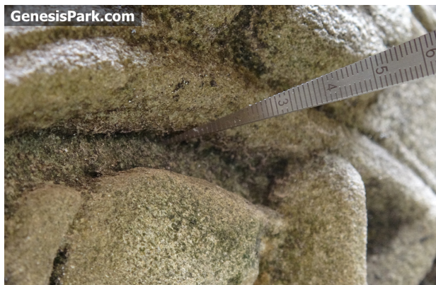
Fig. 10. Water buffalo background.