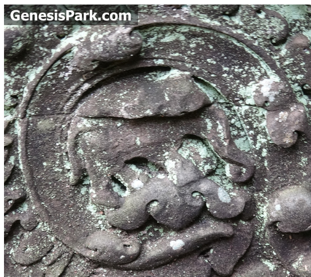
Fig. 7. Elephant engraving.

Finally, it has been suggested that the plates that appear to run along the back are not really part of the creature but are merely background vegetation or decorative flourishes (Switek 2009). Certainly, if the plates are removed (Fig. 8), most of the resemblance to a stegosaur is lost. Therefore, analysis of the plates is very important to the dinosaurian interpretation.