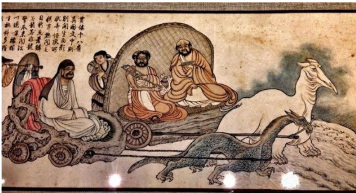
Fig. 15. Chinese dragons pulling carts. Illustration: Wu Bin.

It is well known that the Chinese have historical records of men interacting with dragons. The book Zuozhuan tells the narrative of how the “ancients raised dragons and how the state used the services of two clans known as the Dragon Rearers and the Dragon Tamers” (Sterckx 2012). As early as 1611BC the Emperor of China appointed the post of Royal Dragon Feeder, an official whose primary responsibility was to deliver food into the sacred dragon ponds. Historical records tell of a Song Dynasty (AD 960–1279) Emperor who raised dragons within his palace compound (Niermann 1994). The Song overlapped the construction timeframe of Angkor Wat. The Italian merchant and traveler Marco Polo visited China in the late 13th century and brought back credible dragon reports (Niermann 1994; Polo 1961). Ming Dynasty Chinese landscape painter Wu Bin (1573–1620) served for a time as the Emperor’s secretary. Among his paintings is a piece entitled “Eighteen arhats” (Fig. 15), an ink and color handscroll showing Chinese dragons pulling carts. But the mythical quality to Wu Bin’s work suggests that dragons had become extinct by his time (hundreds of years after the Ta Prohm construction).