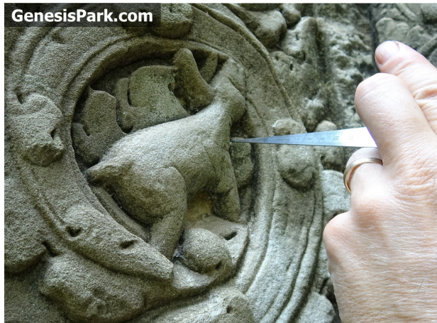
Fig. 9. Water buffalo.