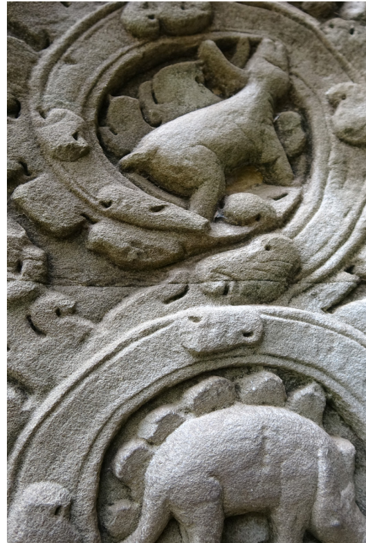
Fig. 12. Relief comparison looking from above.