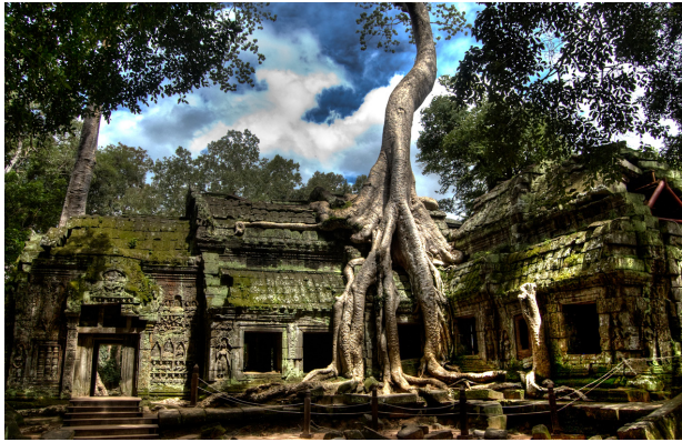
Fig. 3. Ta Prohm Temple.