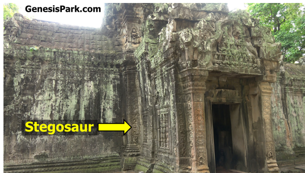
Fig. 5. Doorway as it appears today.

evidence that men and dinosaurs coexisted (Butt and Lyons 2008, 49; Cole 2007; Isaacs 2010, 54; Morris 2008).