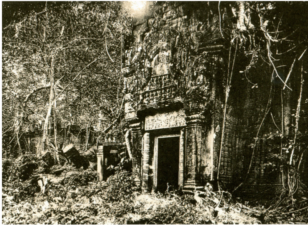
Fig. 4. Dieulefils 1908 doorway photo.