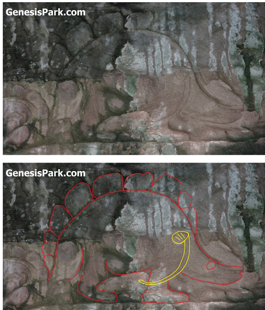
Fig. 16. Second stegosaurus carving (original photo and highlighted).

Again, there is an odd device etched alongside the neck that arrests our attention. In this case, it is shaped like a rope or narrow strap that hangs down and disappears under the animal. I suspect it is a tether for this captive stegosaurus when it was not prepped for public service. Thus, it would seem that this second depiction strengthens the domesticated