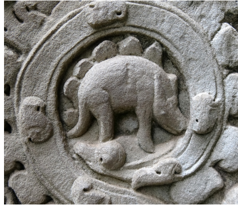
Fig. 1. Stegosaur carving.

Bas-relief artwork at Cambodia's Angkor Wat temple, Ta Prohm, appears to depict a dinosaur (Fig. 1). Though the engraving is readily recognizable as "stegosaur-like," this dinosaurian interpretation of the engraving has been criticized because of the unrealistically large head and the absence of tail spikes. Moreover, it has been suggested that the "plates" are merely decorative flourishes or background foliage. I personally examined the Ta Prohm artwork, took depth measurements and compared the dinosaurian depiction to the many other temple engravings. I came away satisfied that the objections can be adequately answered. Moreover, I believe there is a second stegosaurus carving in the portico of the temple. My hypothesis is that the ancient artists were seeking to model domesticated stegosaurids, dinosaurs that were still living and known at the time of the temple construction.