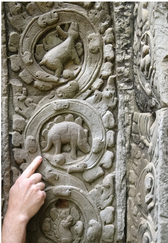
Fig. 11. Stegosaur context.