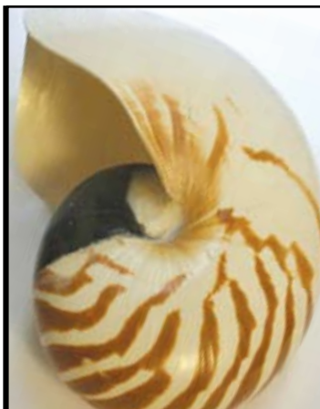
Live — Nautilus