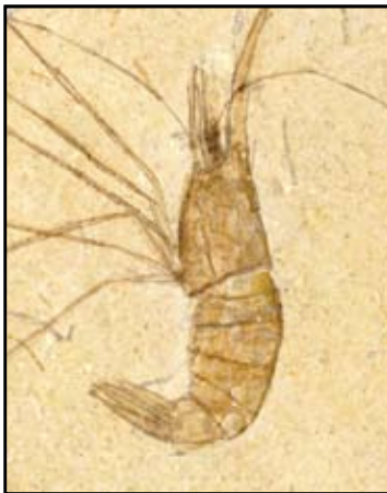
Fossil — Shrimp