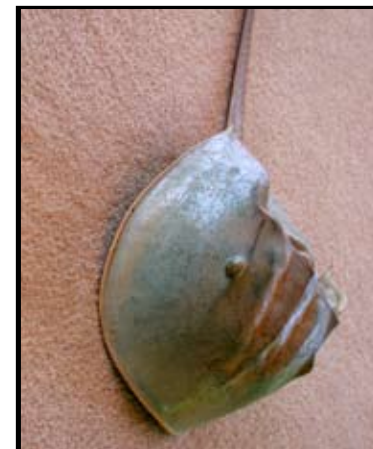
Live — Horseshoe crab