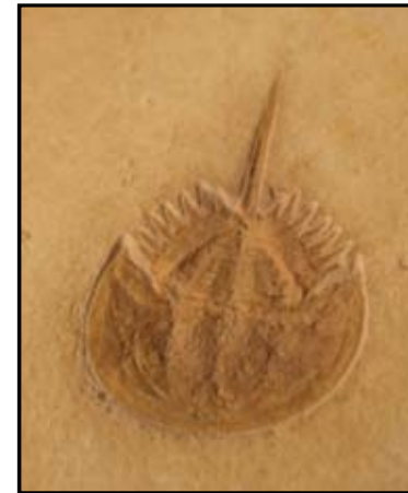
Fossil — Horseshoe crab