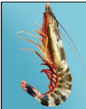
Live — Shrimp