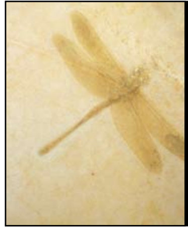
Fossil — Dragonfly