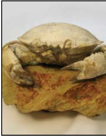
Fossil — Crab

4. Match the fossil (believed to be millions of years old) with the animal we see today.