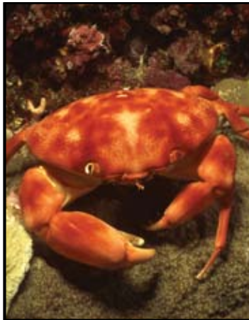
Live — Crab