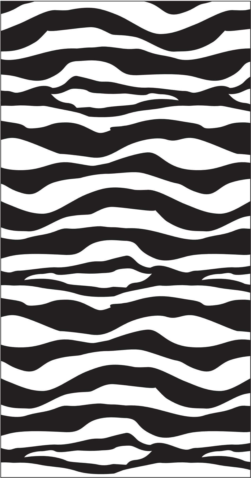
Day 1: Savanna Drum (V.3) Zebra Print (Toddler)

Copyright © 2014 Answers in Genesis. Limited license to copy.