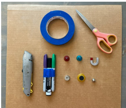
Figure 1: Supplies