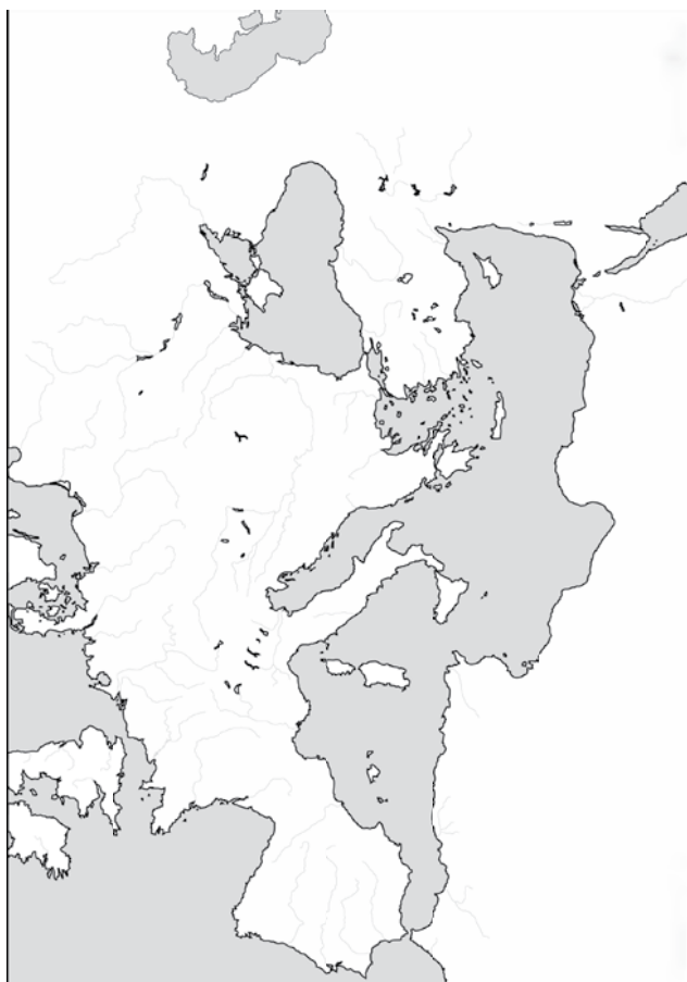
The Rise of the Church &amp; the Fall of Rome 43