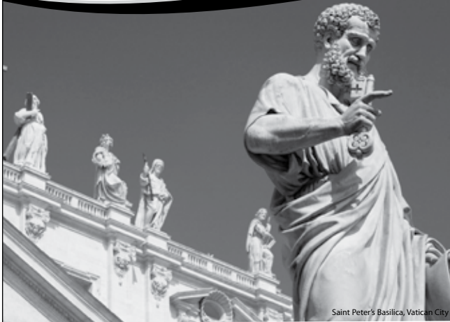
Saint Peter's Basilica, Vatican City