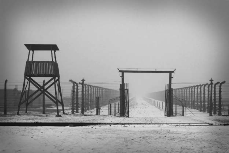
Auschwitz concentration camp, where more than a million people died during World War II, most of them Jews.

Asia, Europe, the Middle East, South America, and so on. But did you know that the concept of human races is not found in the Bible? The philosophy of racism, therefore, is alien to Scripture and originated with men.