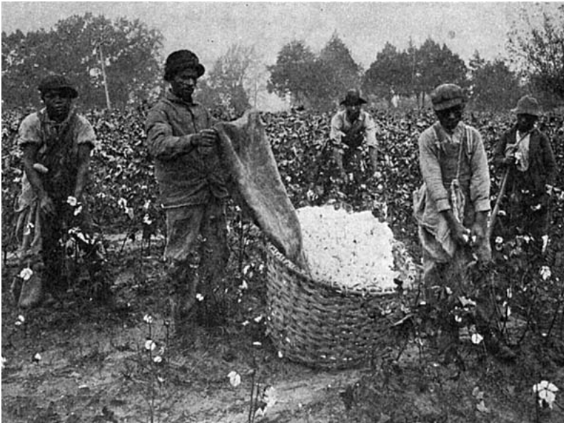
Prior to the Civil War, slaves made up almost the entire work force on plantations in the South.

Rather than esteeming our brothers, we discriminate against them.