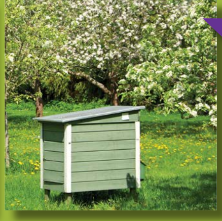
Without bees we wouldn't have cherries, blueberries, apples, onions, cucumbers, avacados, oranges, or Brazil nuts!